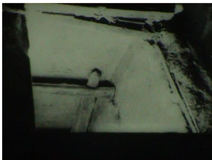
Figure 10. Still from the 1959 Moldova Film production Apostles without Masks showing the entrance to an Inochentist hideout. This image, along with several others in the film, is taken from KGB file ASISRM-KGB 023262 © Archive of the Service for Information and Security of the Republic of Moldova, former KGB.

to 'consolidate Soviet values', the propagandists, journalist and filmmakers, who were enjoying relative freedom of expression in this period (Shaw, 2002, 9; see also Woll, 1999), produced a powerful dichotomy between the 'decent', 'rational' and 'disciplined' citizen and the 'depraved', 'hysterical', 'irrational' and 'savage' sectarian (Dobson, 2014, 241). The contrast between darkness and light seen on screen is illustrated throughout with materials sourced from the same secret police case file as those used in the print publications of the time (see figure 10).