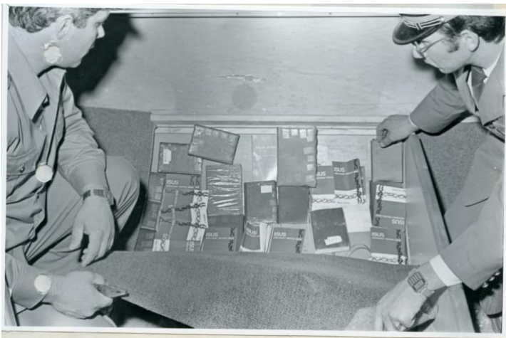
Figure 5. Romanian border guards uncover bibles and religious materials hidden under the floor of a camper van in 1985 (ACNSAS D000003, vol. 1) See Iuliana Cindrea-Nagy, 'Photographs of confiscated religious materials smuggled into Romania', http://hiddengalleries.eu/digitalarchive/s/en/item/215