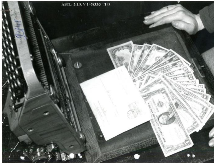
Figure 4. Typewriter with US Dollars hidden inside discovered during a house search of a Hungarian Cistercian monk in 1961 (ÁBTL 3.1.9. V-146835/3) © Historical Archives of the Hungarian State Security. See Kinga Povedák, 'Evidence of illegal activity of underground Catholic religious order Hungary', http://hiddengalleries.eu/digitalarchive/s/en/item/4