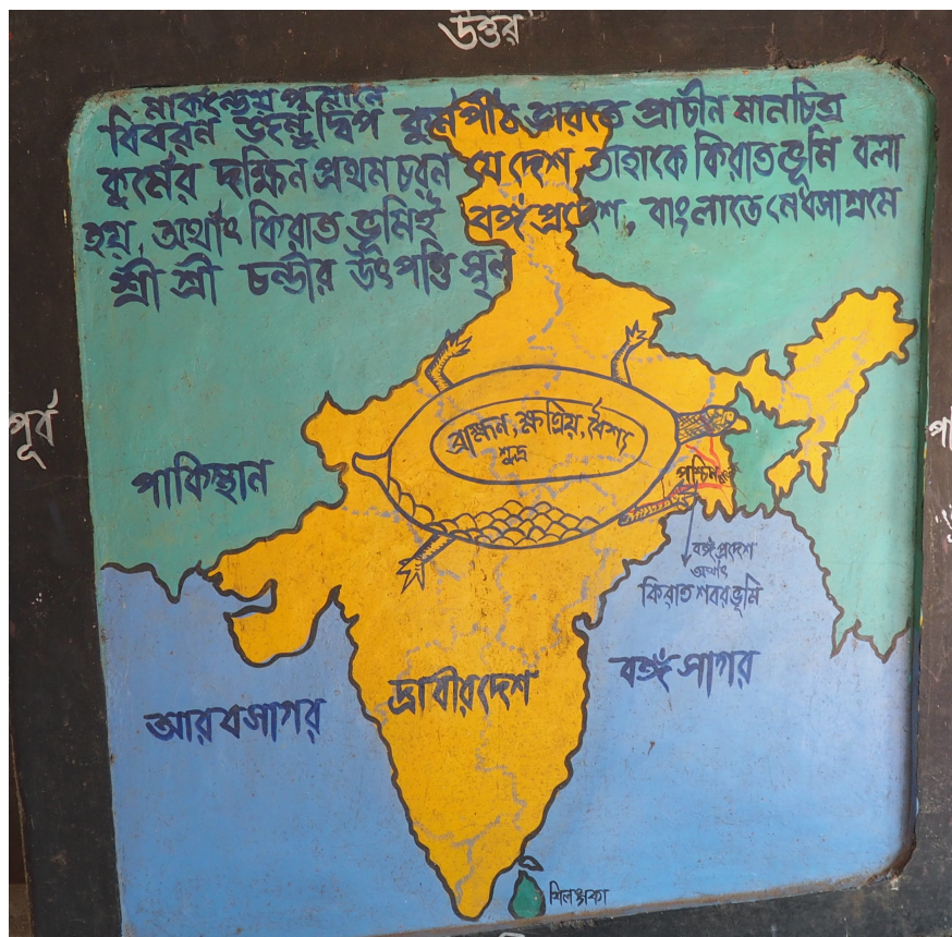
Fig. 1 Map of north India represented as a turtle.

To visually support this claim, a map of India (Fig.1) has been painted and installed in Garh Dhām.