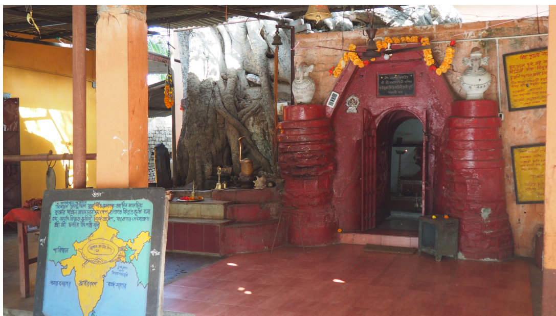
Fig. 3. Temple of Sarasvatī.

Since its inauguration many improvements have been implemented in the āśram . In Fig. 3 we can see the temple of Sarasvatī, which Jogi Baba was said to have found entrapped by the roots of another ancient tree, now completely renovated. In front of this temple the dhūnī of Jogi Baba, the everlasting fire arranged by every sādhu , has been installed.